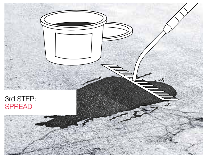
3rd STEP: SPREAD

Before installation remove any dirt from the surface.