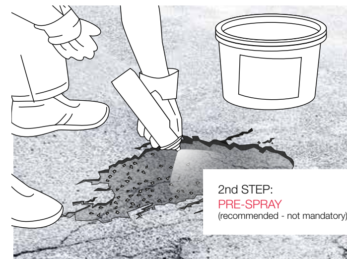
2nd STEP: PRE-SPRAY (recommended - not mandatory)

Spread the required amount of EASYPHALT® slightly protruding the height of the original surface.