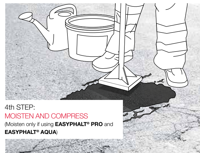
4th STEP: MOISTEN AND COMPRESS (Moisten only if using EASYPHALT® PRO and EASYPHALT® AQUA )

RECOMMENDATION: For maximum durability, we advise that you treat the installation surface with a bituminous primer like EASYPHALT® PRIME .