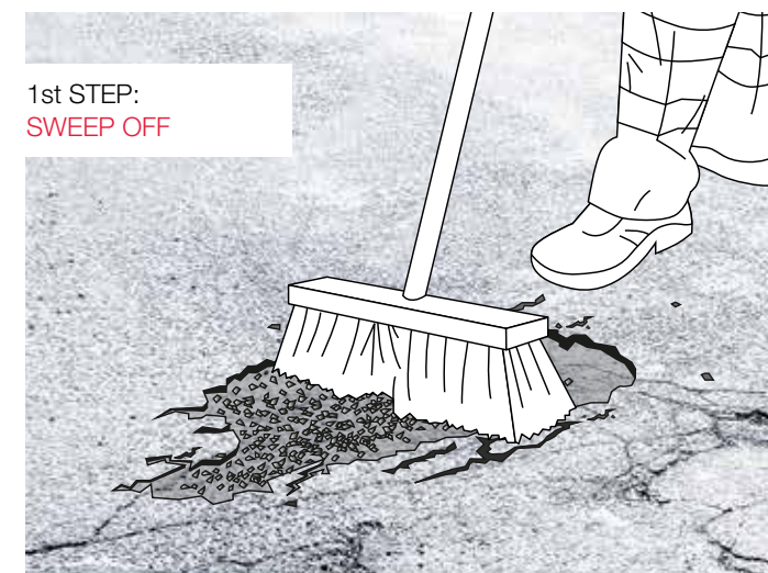
1st STEP: SWEEP OFF

Get the success you want with little effort: